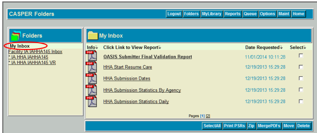
Figure A-7. CASPER Folders Page – My Inbox Folder

Each report name is a link with which you may open and view the contents of that report. The Date Requested listed for each report is the date and time you submitted the report request.