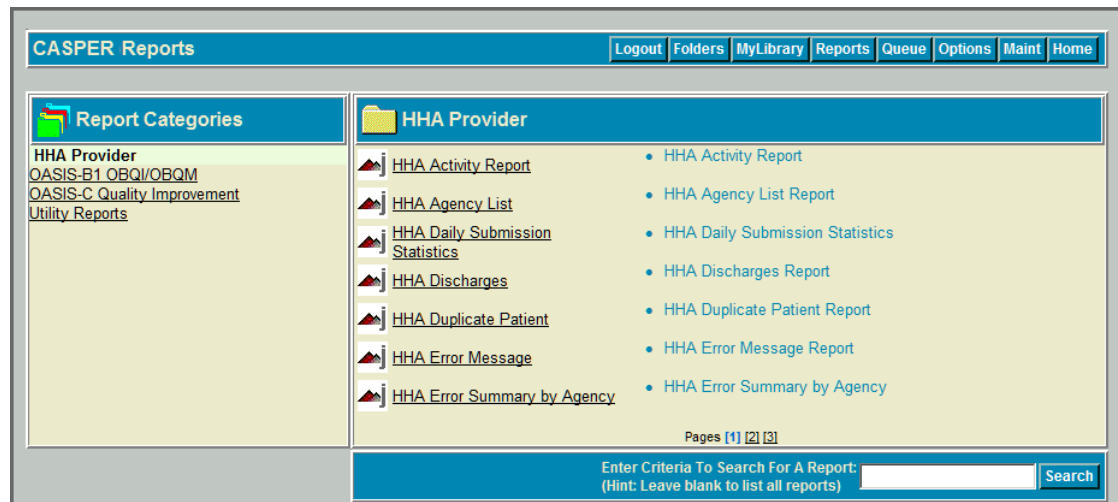
Figure A-5. CASPER Reports Page