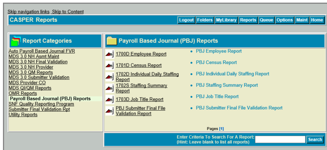
Figure 12-1. CASPER Reports Page – Payroll Based Journal (PBJ) Reports Report Category

The Payroll Based Journal (PBJ) Reports report category is requested on the CASPER Reports page (Figure 12-1).