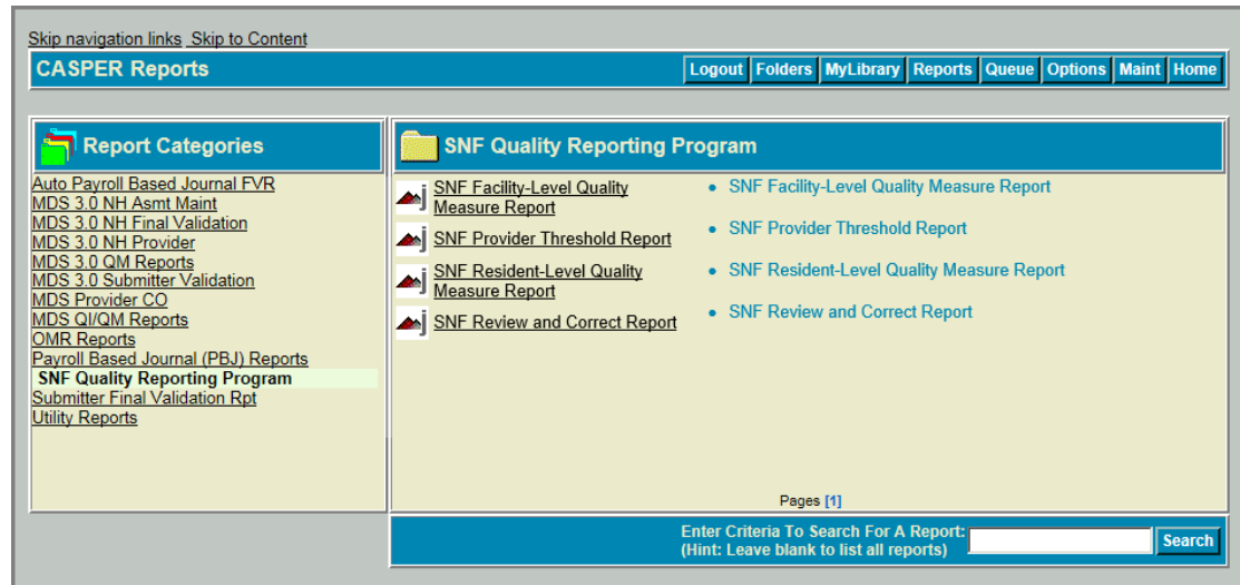
Figure 13-1. CASPER Reports Page – SNF Quality Reporting Program Category

Skilled Nursing Facility (SNF) Quality Reporting Program (QRP) reports are requested on the CASPER Reports page (Figure 13-1).