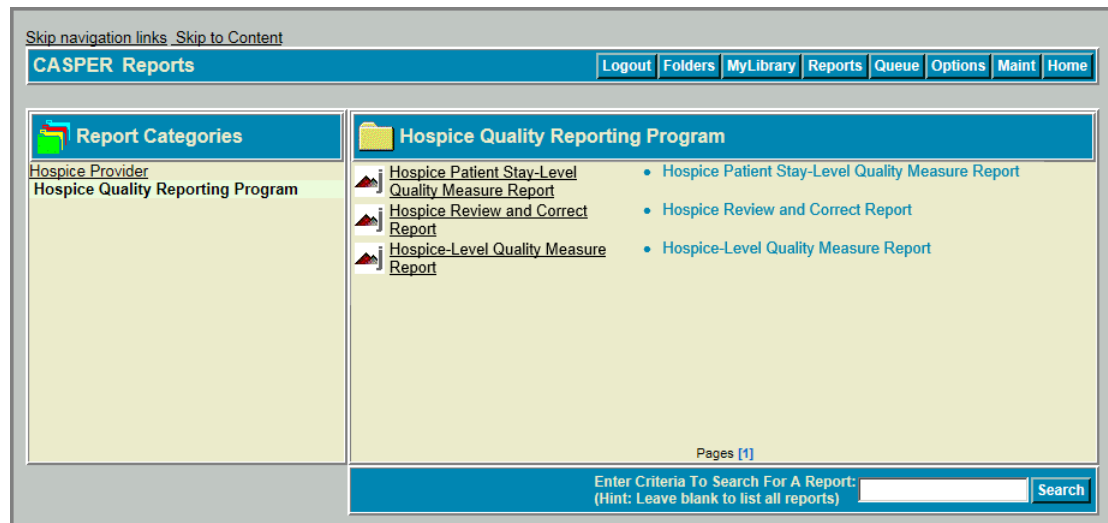
Figure 4-1. CASPER Reports Page – Hospice Quality Reporting Program Category

Hospice Quality Reporting Program (QRP) reports are requested on the CASPER Reports page (Figure 4-1).